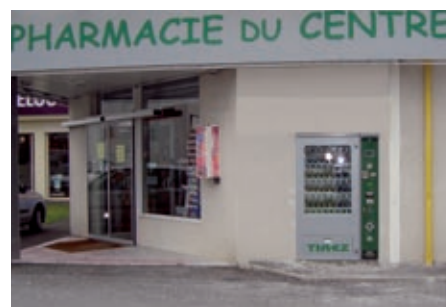
Francia - Oloron