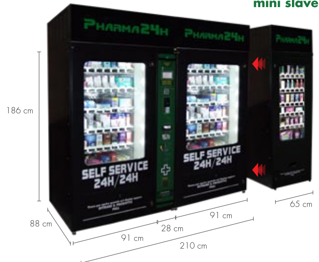
Module mini slave