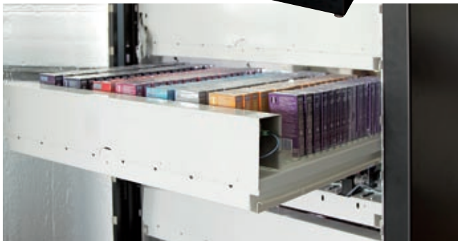
Possibility of loading from the back