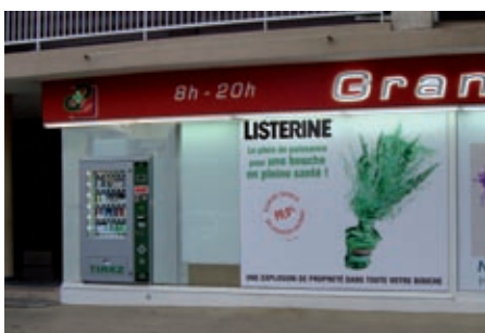
Francia - Nimes