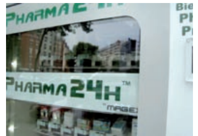
Particular of the elevator