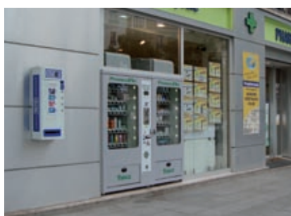
Francia - Porta d'orleans - Parigi